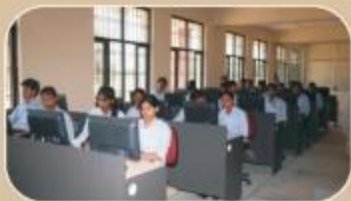
IT enabled Classrooms